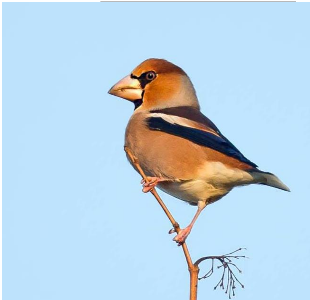
Hawfinch