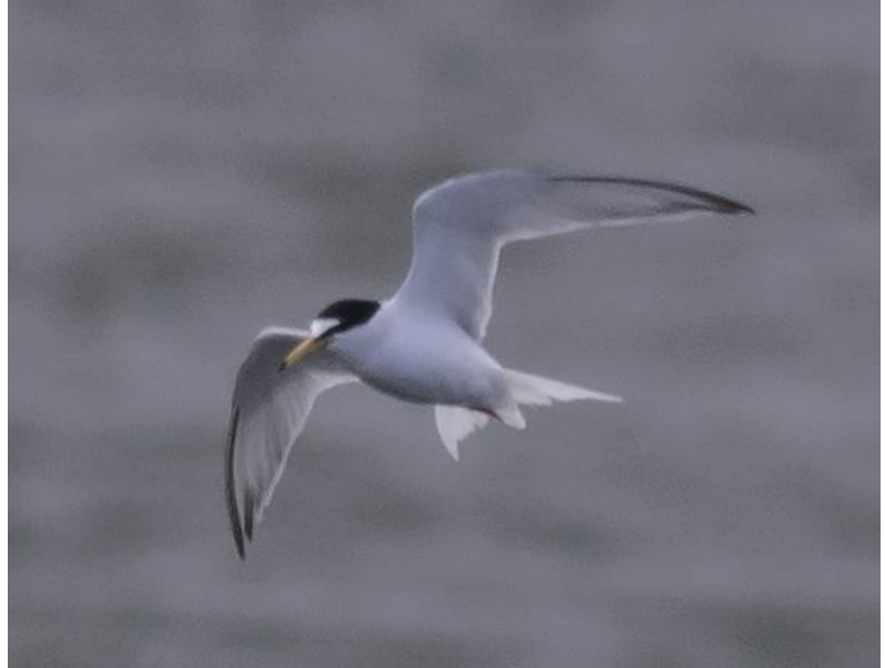
Little Tern – Steve Day