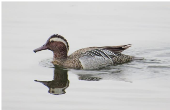
Garganey