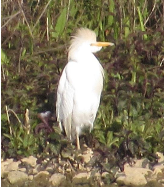
Cattle Egret – Roger Stansfield