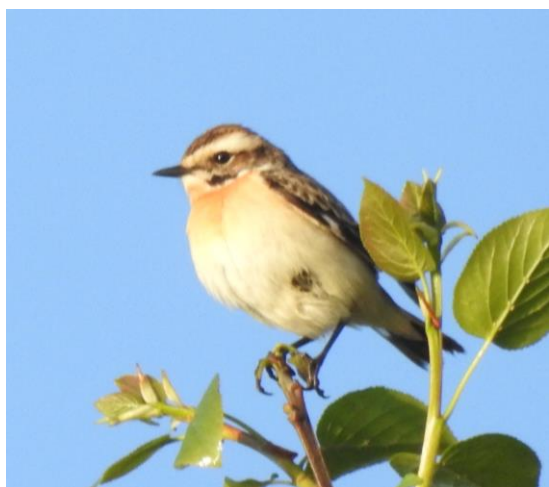
Whinchat – Jack Jones

May – Grasshopper Warbler 3 rd (GSE), a Wood Sandpiper claim 4 th , 1 Arctic Tern BSL 3 rd (FJC), 1 Little Tern 7 th LFGP (FJC), moved to BSL, where 2 Little Gull were seen later (D Mackenzie), 7 Black Tern 11 th LFGP (FJC, Jack & Jules Jones), Whinchat near to the hide, Greenshank, the latter staying till 10 th , Whimbrel 11 th (GSE), 1 Oystercatcher chick on Sandford 30 th only.