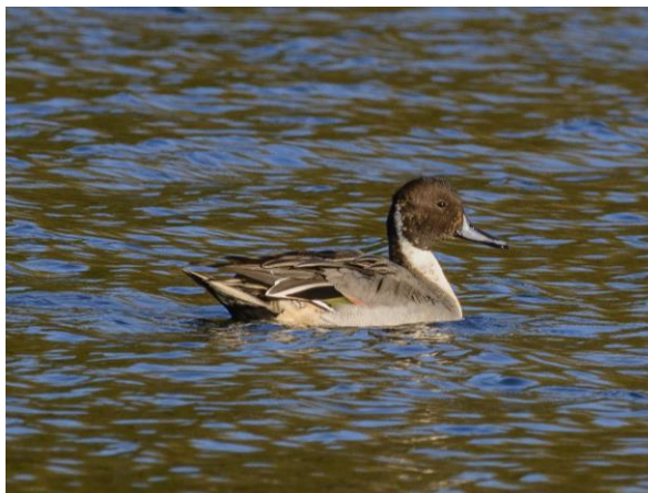
Pintail – Steve Day

June – Mandarin family along Loddon 4th, Med Gull 17 th (A Rymer), Green Sandpiper from 23 rd , 2 Common Sandpiper 24 th . Little-ringed Plover displayed all month, but never settled, same for Redshank, 7 pairs Common Tern nested on the shingle island, the Black-headed Gulls took over the raft. Sand Martins finally nested at LFGP, around 20 pairs, plus 7+ double brooded.