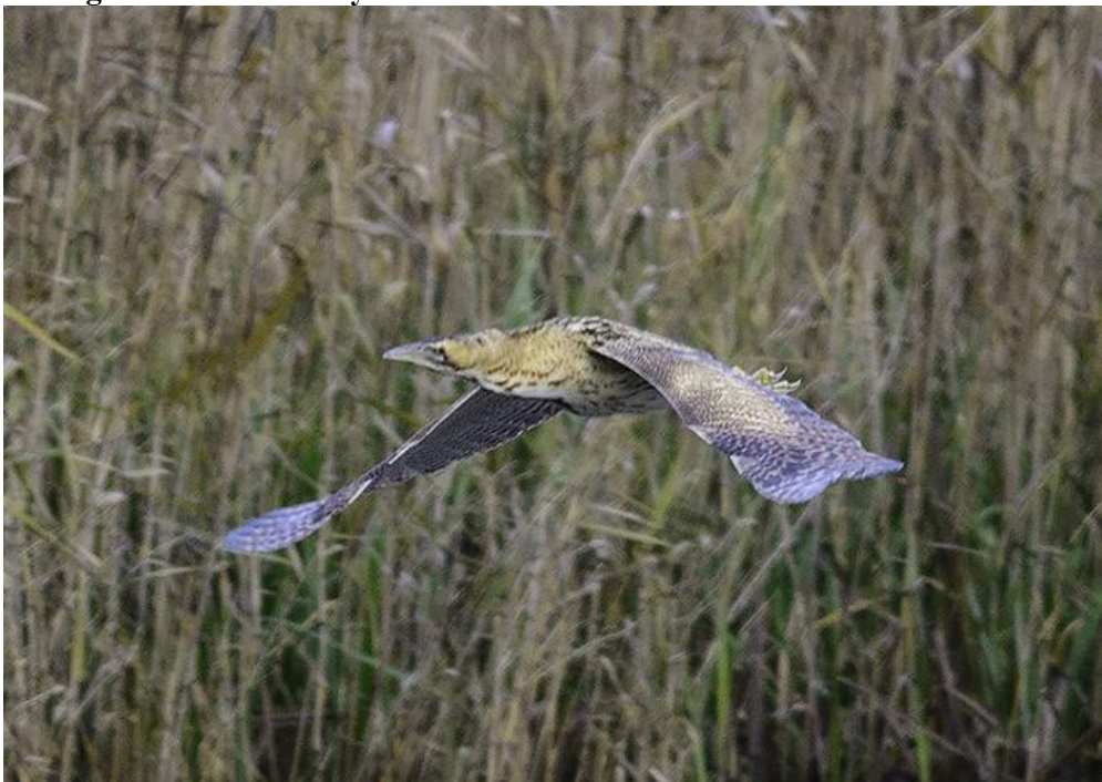
Bittern – Steve Day