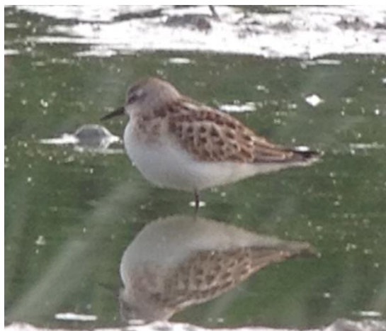
Little Stint - FJC

September – A nice count of 51 Shoveler on BSL 1 st (MFW), another Spotted Flycatcher 2 nd (RNM), Swift & 3 Wheatear (FJC), male Redstart 5 th (B May et al), 7 Green Sandpiper, female Redstart (A Rymer), 2 Redstart 7 th (ADB), Little Stint on 8 th stayed just moments after being found (FJC), another Whinchat 9 th (FJC), 2 Hobby (Bob Bennett), 63 Shoveler 10 th , another male Redstart 11 th (bird walk), 2 Whinchat 12 th (GSE & Bob Bennett), 3 Yellow Wagtail, 4 Hobby 15 th (FJC), 16 th was fun - 7 Dunlin , 2 Red-legged Partridge , Whinchat & Wheatear (FJC), Spotted Flycatcher (SPD), 17 th 2 Red-legged Partridge , 1 Pintail, Spotted Flycatcher (P Stancliff), 18 th male Stonechat (FJC), Spotted Flycatcher (RNM), Garganey (MFW & TAG). The Garganey then showed up each morning at BSL staying til at least 1 st Oct. 7 Grey Wagtail 20 th was the peak passage count at the sailing club, Siskin 21 st (MFW), 10 Pintail 22 nd (FJC), was a new record count. Stonechat again 23 rd (RNM), 2 Pintail, 3 Raven was one of several sightings, 5 Mandarin – 4m, 1f 27 th (FJC) - a new record count of adults