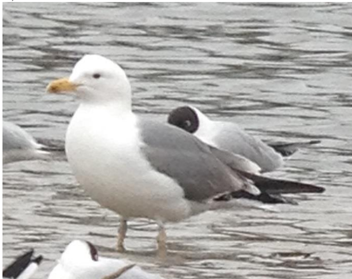
Yellow-legged Gull - FJC

April – Most migrants arrived around average dates, Wheatear 3 rd (MFW), Yellow Wagtail 5 th , early Reed Warbler and Whitethroat 8 th , 30-40 late Golden Plover 10 th (FJC), a nice adult Little Gull 13 th (MFW et al), but bird of the month was a male Ring Ouzel in the car park field 13 th (BTB et al), Lesser Whitethroat 13 th too, male Redstart in the BSL/WSL hedgerow (J C Morgan) and there was 1 Arctic Tern WSL 16 th (TAG) and BSL 24 th (FJC & BTB).