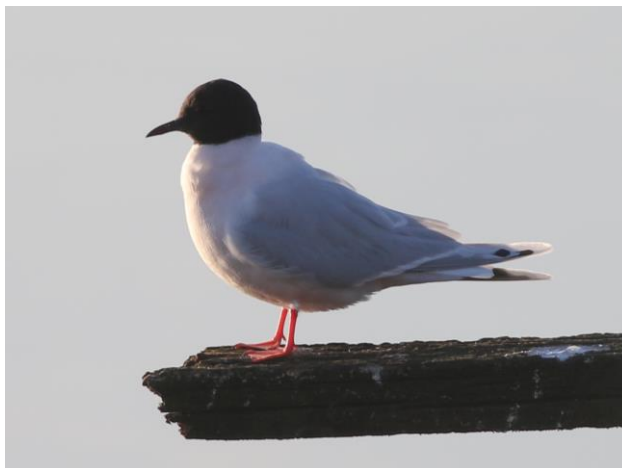
Little Gull