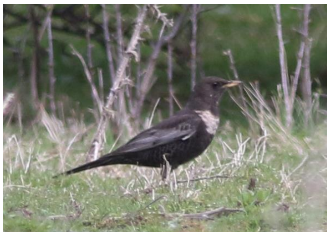
Ring Ouzel