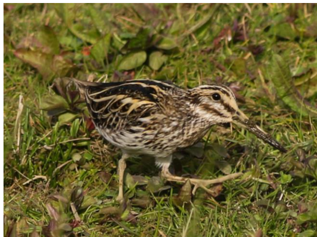
Jack Snipe – Marek Walford

May – Singing Water Rail 3 rd , another Wheatear 3 rd (BTB), 2 Greenshank 5 th (RNM), an exceptionally late Jack Snipe 5 th LFGP (Roger Stansfield et al), a Ringed Plover 6 th (GSE et al), a Sandwich Tern on Sandford briefly 10 th (P Scudamore), Black Tern 11 th LFGP (MFW et al), passing Teal 20 th (S Day), Pochard 23 rd (P Scudamore).