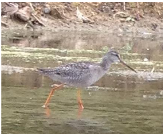
Spotted Redshank – FJC

September – A nice count of 51 Shoveler on BSL 1 st (MFW), another Spotted Flycatcher 2 nd (RNM), Swift & 3 Wheatear (FJC), male Redstart 5 th (B May et al), 7 Green Sandpiper, female Redstart (A Rymer), 2 Redstart 7 th (ADB), Little Stint on 8 th stayed just moments after being found (FJC), another Whinchat 9 th (FJC), 2 Hobby (Bob Bennett), 63 Shoveler 10 th , another male Redstart 11 th (bird walk), 2 Whinchat 12 th (GSE & Bob Bennett), 3 Yellow Wagtail, 4 Hobby 15 th (FJC), 16 th was fun - 7 Dunlin , 2 Red-legged Partridge , Whinchat & Wheatear (FJC), Spotted Flycatcher (SPD), 17 th 2 Red-legged Partridge , 1 Pintail, Spotted Flycatcher (P Stancliff), 18 th male Stonechat (FJC), Spotted Flycatcher (RNM), Garganey (MFW & TAG). The Garganey then showed up each morning at BSL staying til at least 1 st Oct. 7 Grey Wagtail 20 th was the peak passage count at the sailing club, Siskin 21 st (MFW), 10 Pintail 22 nd (FJC), was a new record count. Stonechat again 23 rd (RNM), 2 Pintail, 3 Raven was one of several sightings, 5 Mandarin – 4m, 1f 27 th (FJC) - a new record count of adults