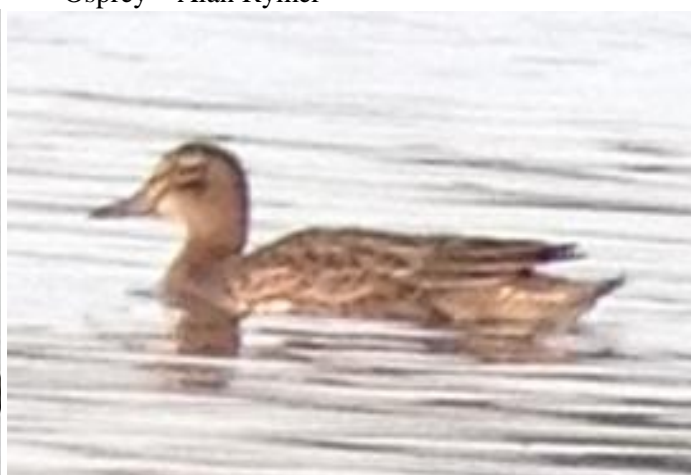
Garganey - FJC