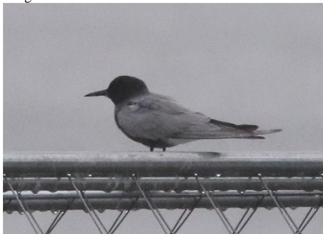
Black Tern – Marek Walford