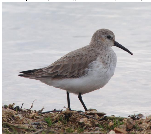
Dunlin