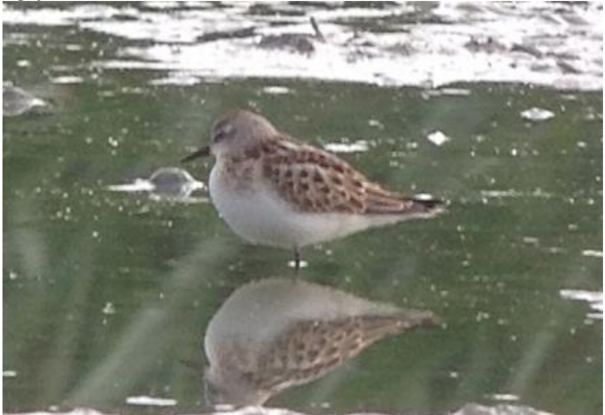
Little Stint – Fraser Cottington