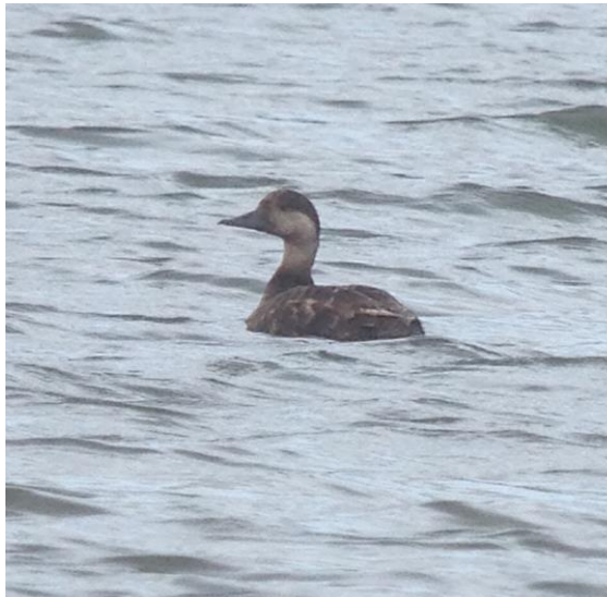
Common Scoter - FJC

September – Again busy times, 1-2 Wheatear on several dates, late Common Tern 2 nd (MFW), another Redstart 3 rd (FJC, ARy & RNM), the first Siskin of the year 4 th (FJC), Whinchat 4 th (BTB) & 5 th (MFW et al), the Bittern was seen until the 9 th , same day 5 Pintail turned up on Lavell's (TAG & Gavin Turner), but were gone in a few minutes. Still on the 9 th 2 eclipse Red Crested Pochard showed up (L Seward), one staying until 25 th . Raven on various dates, 1 or 2 Mandarin and Pochard records, 1-2 Hobby all month, Meadow Pipit passage was evident from around the 11 th (PSc), 70/19 th , 100+/24 th , 150+/26 th , 200+/28 th on the day the farmer cut the grass and just 8/29 th . A late Swift on the 12 th (FJC), light passage of Yellow Wagtail until 17 th , Spotted Flycatcher 1 st to 16 th , Lesser Whitethroat back on form, 1-2 birds 1 st to 18 th , also on the 18 th a mega – our 4 th Great White Egret dropped onto LFGP (ARy) and stayed for less than 3 minutes. 2 Coal Tit daily around the car park field, late Garden Warbler 25 th (RNM & L Seward), Redwing 29 th (FJC), 2 Lesser Redpoll (MFW).