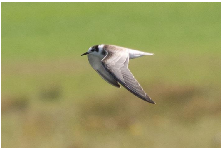
Black Tern – Steve Day