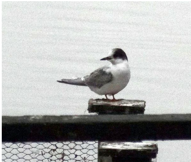
Arctic Tern – Alan Rymer

Black Tern there (A Tomzcinski), 1 of which stayed until the 21 st . 4 Yellow Wagtail 17 th (MFW), 1 Greenshank 19 th (BTB) Grasshopper Warbler briefly next to Ron's hide 20 th (Ron Bryant), Little Egret numbers rising all month, 9 then 10/18 th , 12/20 th , 13/21 st , 14/24 th and a peak of 15/25 th (Ron Bryant). Very unusually a Stonechat on 21 st (RNM), was in Tern meadow very briefly, 5 Greenshank 24 th over 07:03 (MFW & FJC), Redstart in the car park field 25 th (FJC et al), 2/27 th to 29 th , 1/30 th , 5 Spotted Flycatcher 25 th , 4 in the sailing club compound ( BTB ), 5/26 th and 6/27 th . On the last day of the month a Bittern was found at LFGP (GSE), staying for about a week.