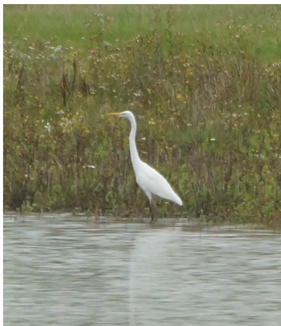
Great White Egret - Alan Rymer

September – Again busy times, 1-2 Wheatear on several dates, late Common Tern 2 nd (MFW), another Redstart 3 rd (FJC, ARy & RNM), the first Siskin of the year 4 th (FJC), Whinchat 4 th (BTB) & 5 th (MFW et al), the Bittern was seen until the 9 th , same day 5 Pintail turned up on Lavell's (TAG & Gavin Turner), but were gone in a few minutes. Still on the 9 th 2 eclipse Red Crested Pochard showed up (L Seward), one staying until 25 th . Raven on various dates, 1 or 2 Mandarin and Pochard records, 1-2 Hobby all month, Meadow Pipit passage was evident from around the 11 th (PSc), 70/19 th , 100+/24 th , 150+/26 th , 200+/28 th on the day the farmer cut the grass and just 8/29 th . A late Swift on the 12 th (FJC), light passage of Yellow Wagtail until 17 th , Spotted Flycatcher 1 st to 16 th , Lesser Whitethroat back on form, 1-2 birds 1 st to 18 th , also on the 18 th a mega – our 4 th Great White Egret dropped onto LFGP (ARy) and stayed for less than 3 minutes. 2 Coal Tit daily around the car park field, late Garden Warbler 25 th (RNM & L Seward), Redwing 29 th (FJC), 2 Lesser Redpoll (MFW).